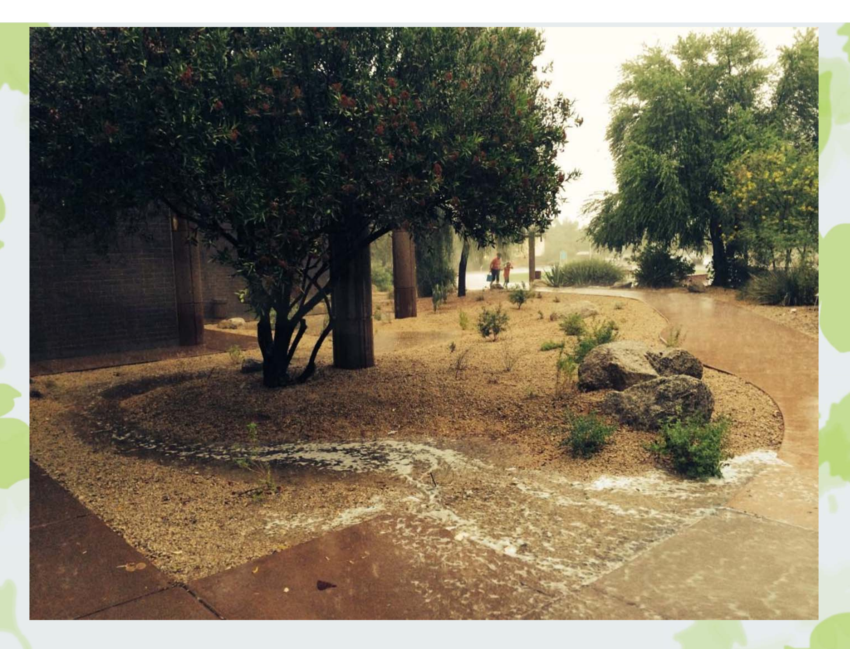
Rain Garden at Glendale's Main Library